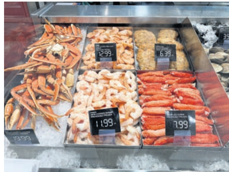
Fresh seafood is shown for sale at a grocery store, Wednesday, July 27, 2022, in Surfside, Fla.